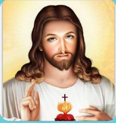
Jesus Christ Our Founder