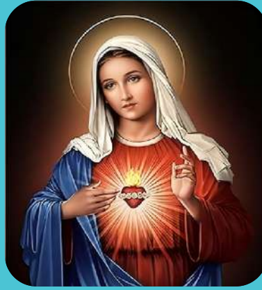
Mother Mary Our Mother