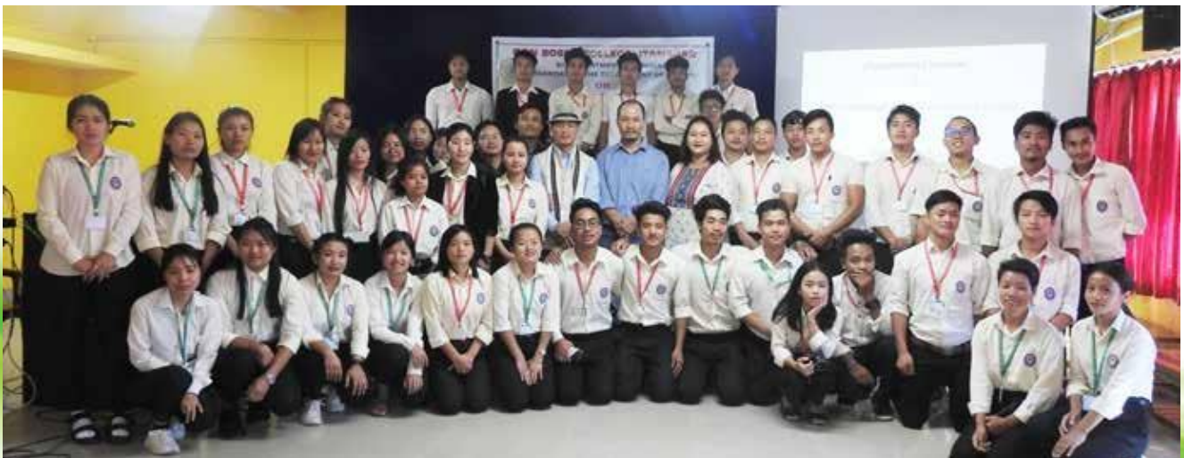
Department of History-1 st November, 2019