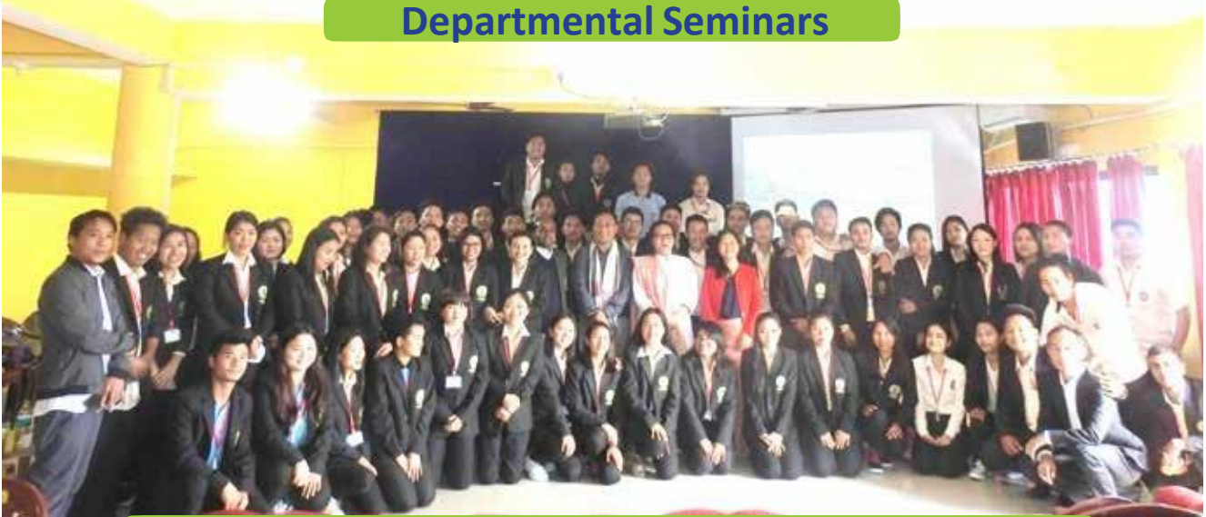
Department of Political Science-22 nd February, 2020