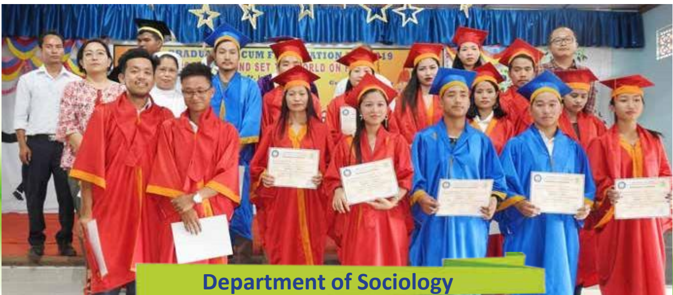
Department of Sociology