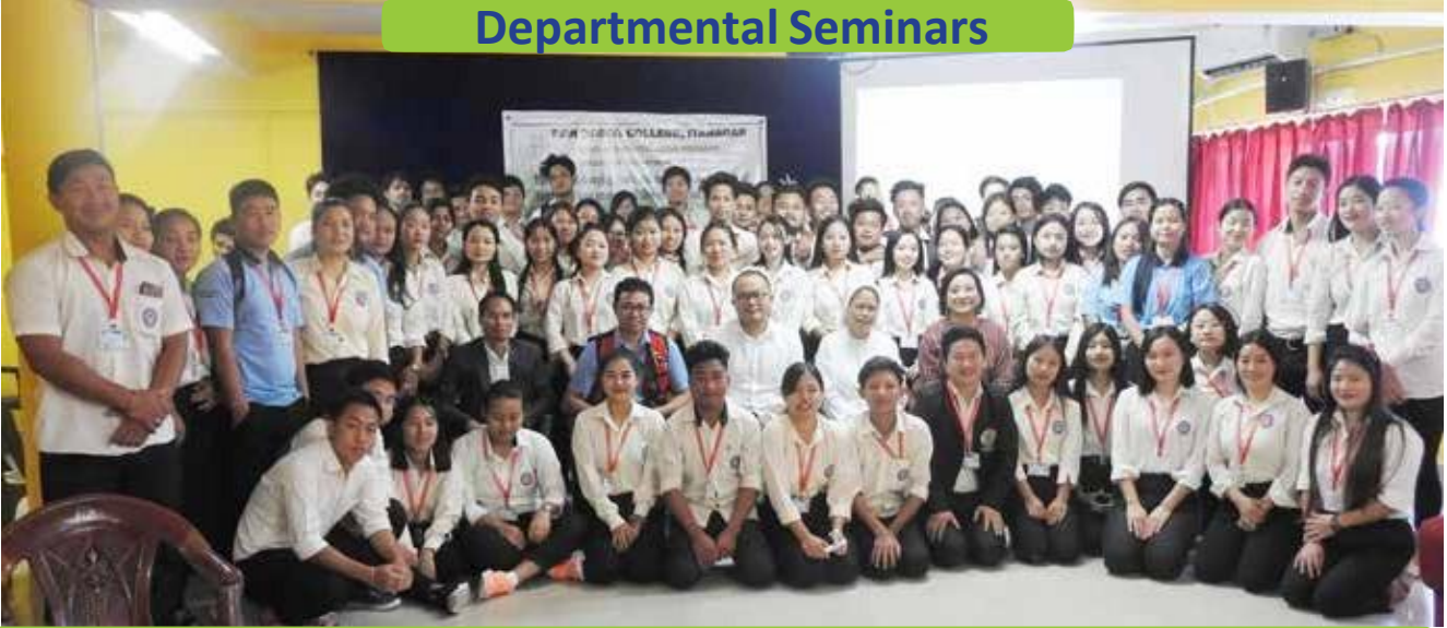
Department of Sociology-29 th October, 2019