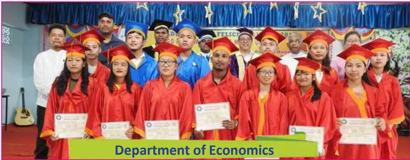
Department of Economics