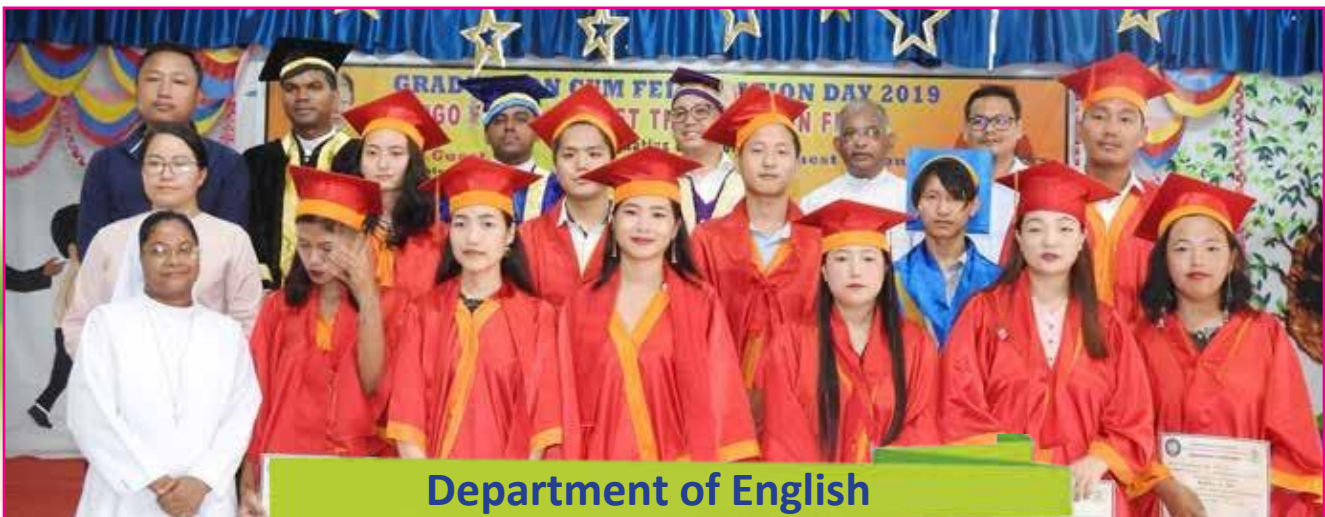
Department of English