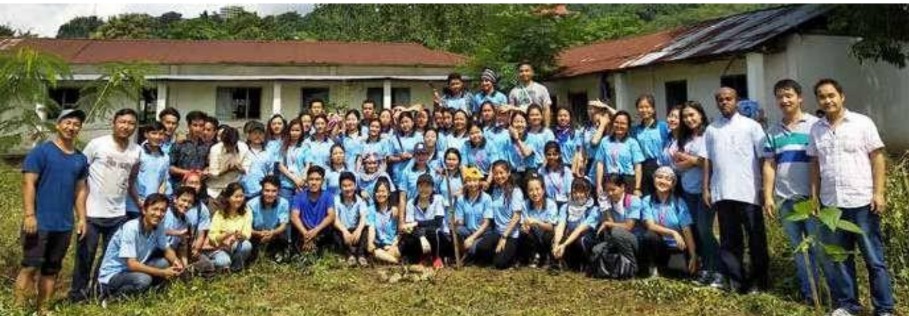
Gandhi Jayanti 2 nd October, 2019