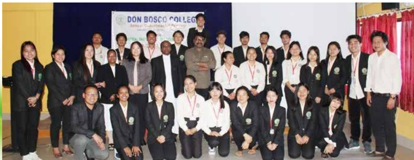
Department of English-13 rd March, 2020