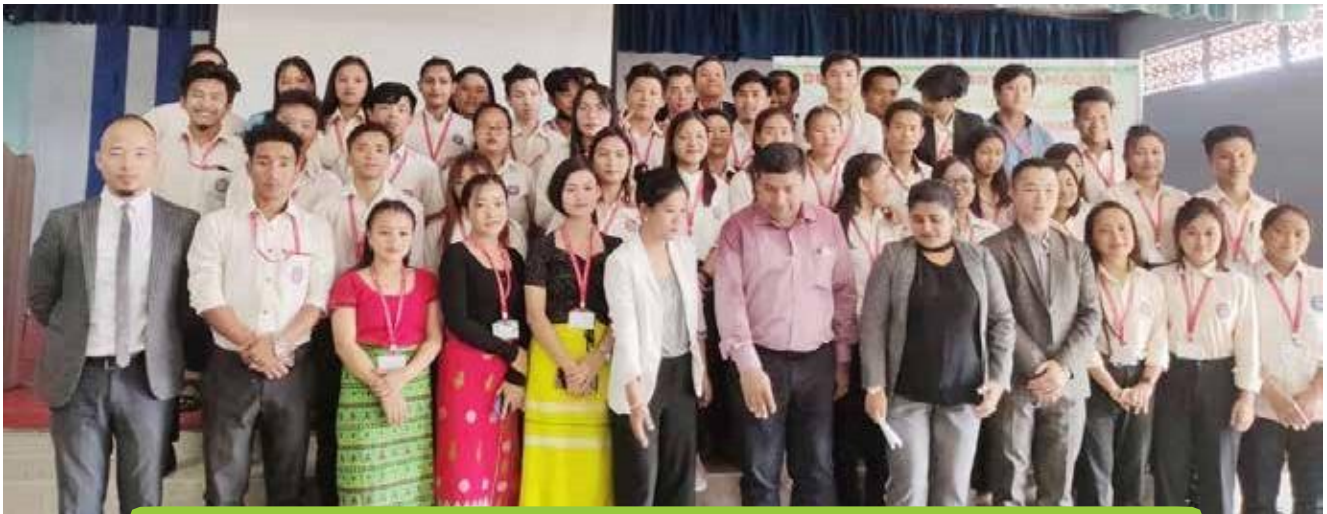
Department of Commerce-31 st October, 2019