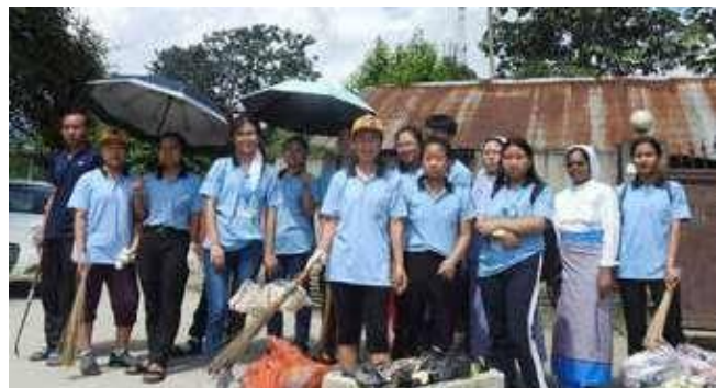
JESUS YOUTH CLUB