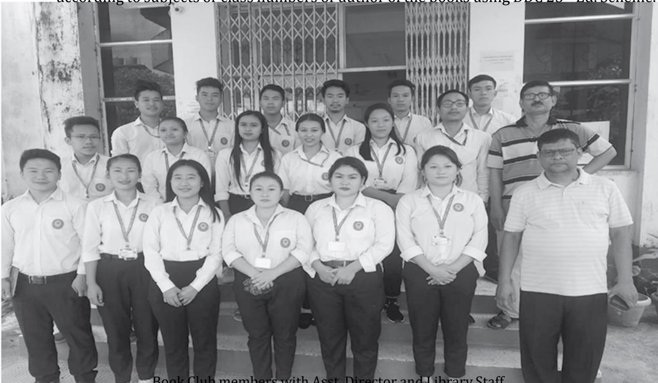
Book Club members with Asst. Director and Library Staff