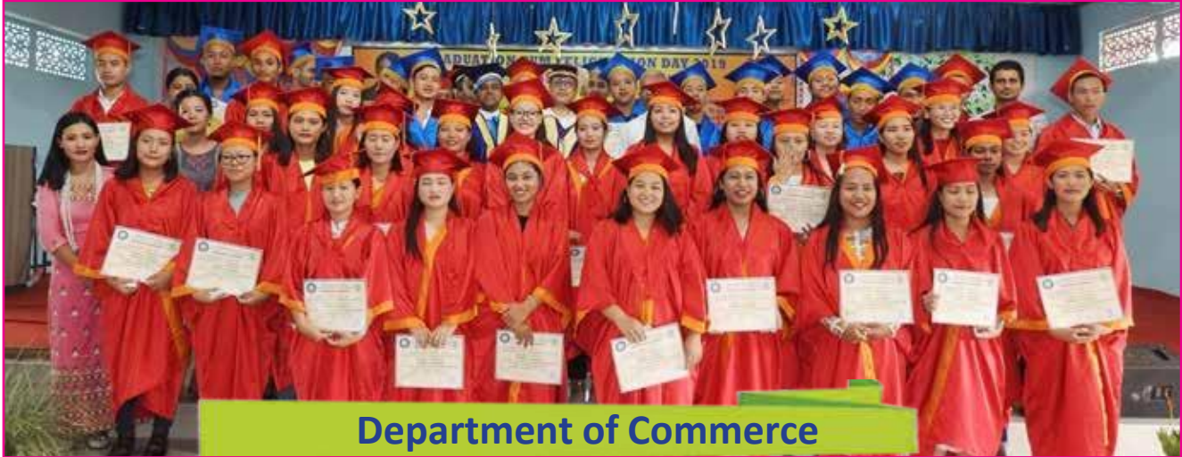
Department of Commerce

Er. Taba Tedir, Hon'ble Minister: Education, Cultural Affairs & Dept. of Indigenous Affairs, A.P. as the Chief Guest