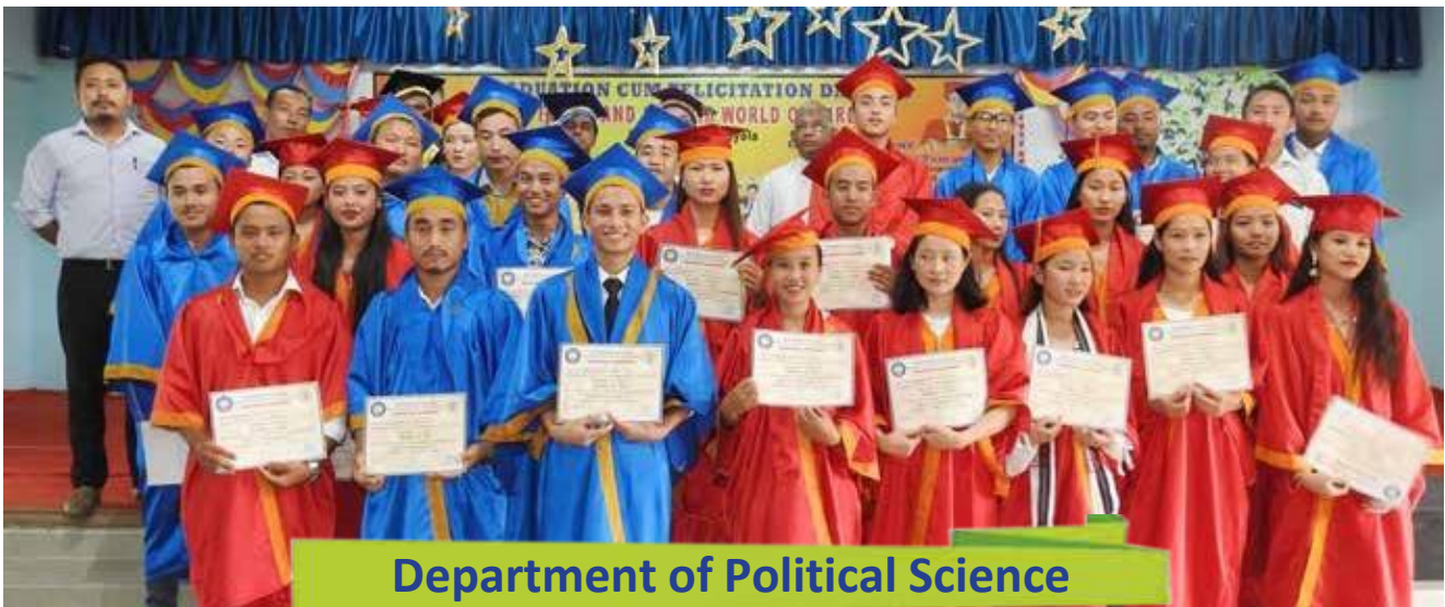
Department of Political Science