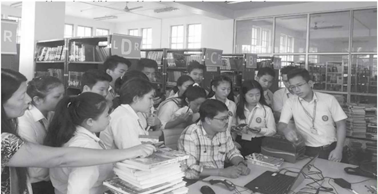
Explaining about how to search in Web OPAC Using Koha Software

i) Children section: This section's major purpose is to support the provision of the library service and reading promotion among the children and young adults throughout the state. In