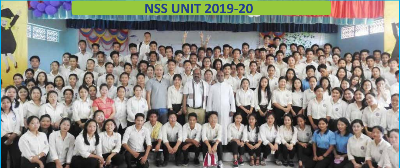
NSS Initiation Day, 24 th August, 2019