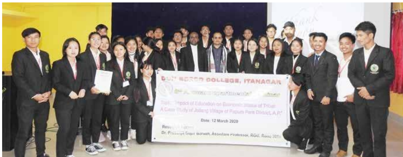
Department of Economics-12 th March, 2020