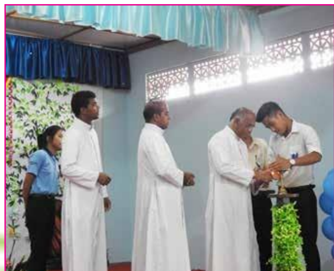
16 th Foundation Day and Birthday of Don Bosco