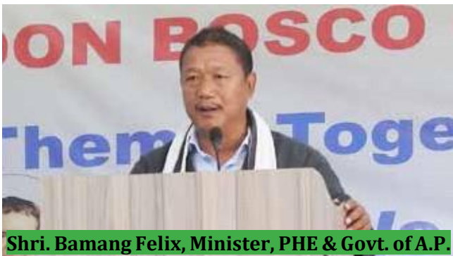
Shri. Bamang Felix, Minister, PHE & Govt. of A.P.