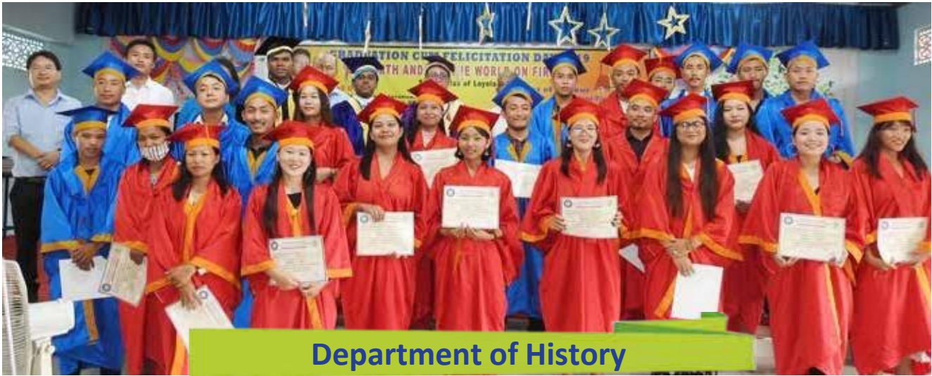
Department of History