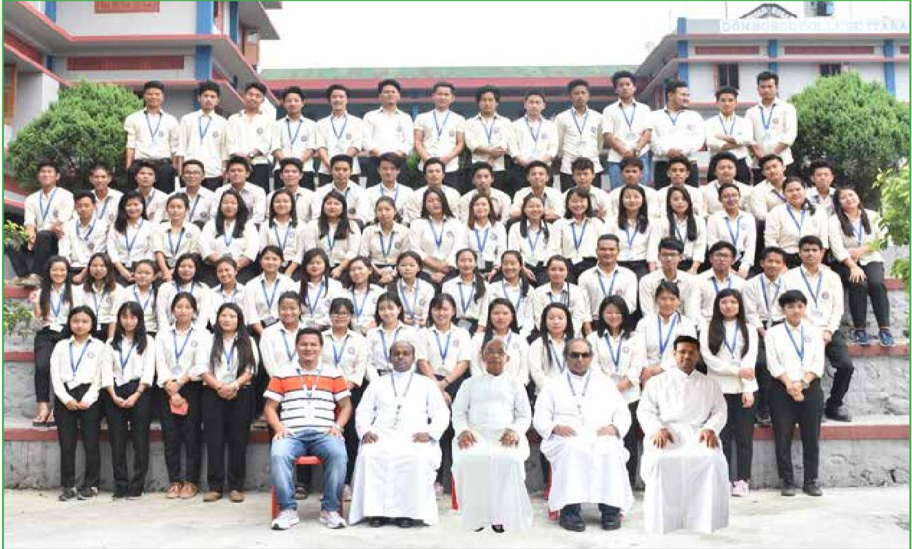
B.A. II semester, Sec-A