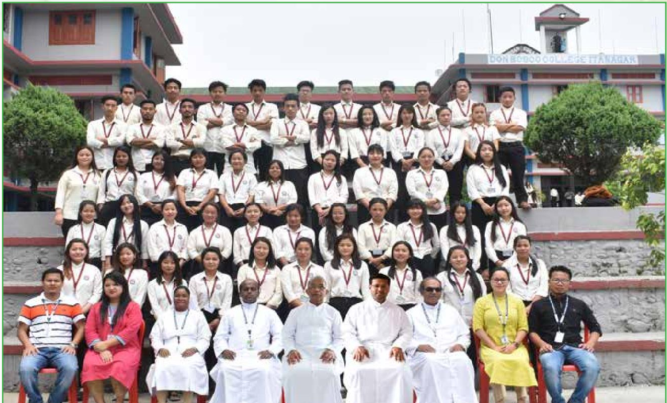
B.A. VI semester - Dept. of English