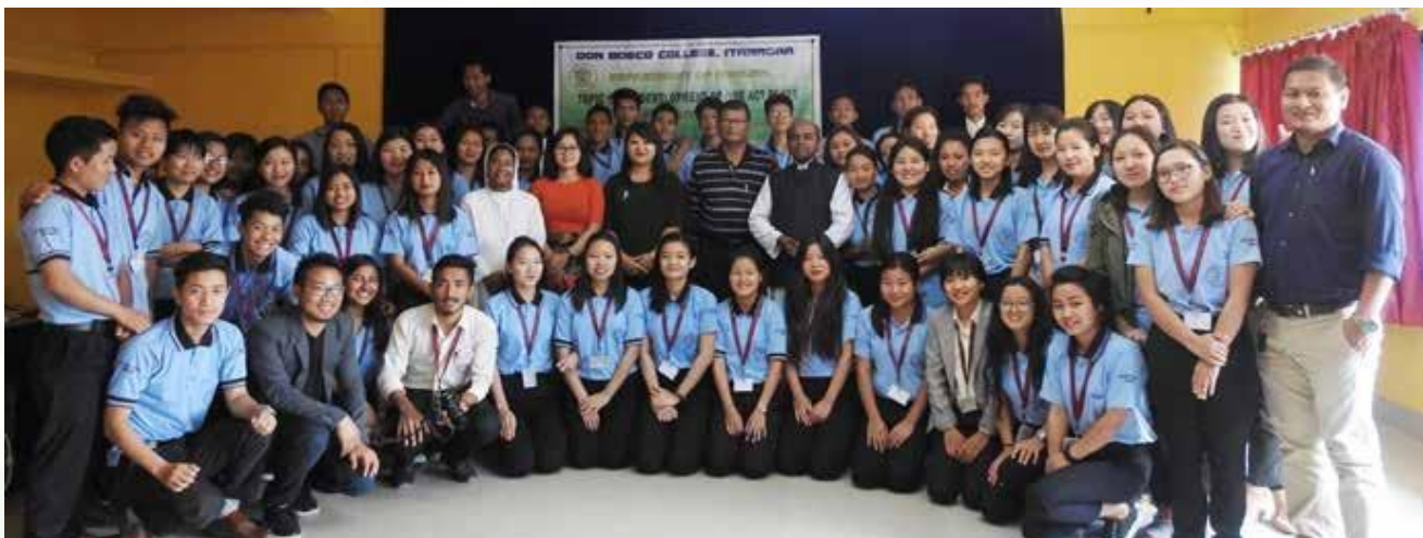
Department of English