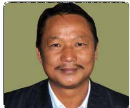
Shri Bamang Felix Minister, PHE & Govt. Spokesperson