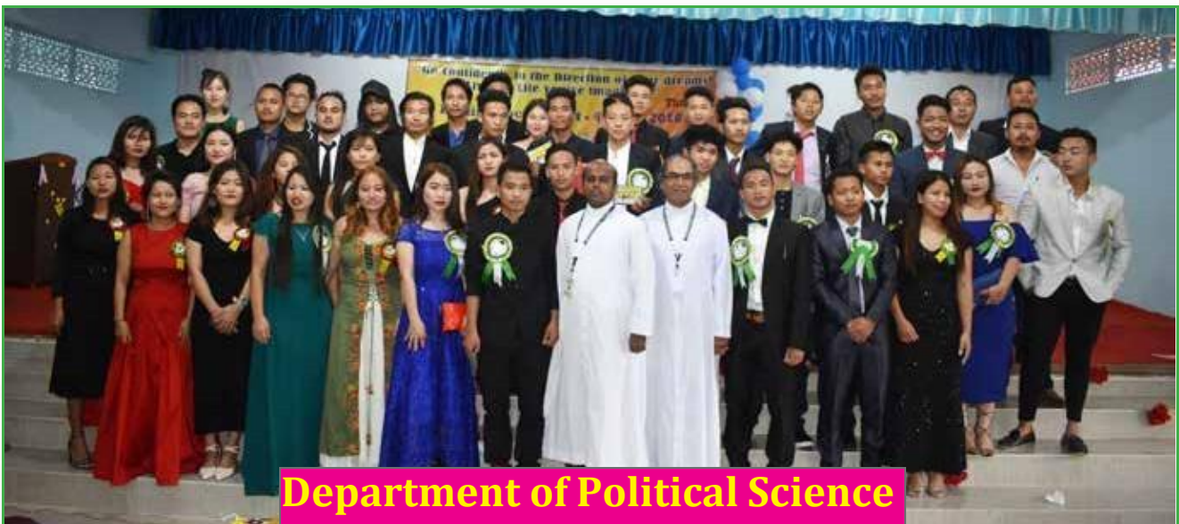
Department of Political Science