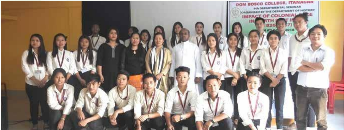
Department of History