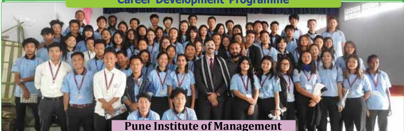
Pune Institute of Management