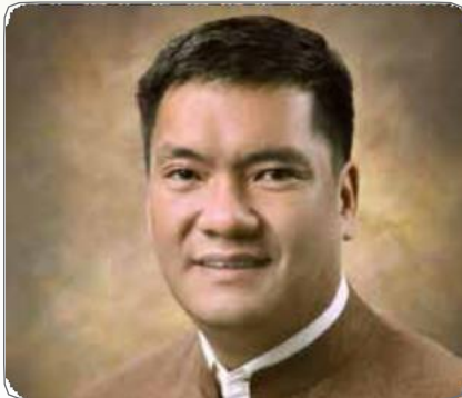
Shri Pema Khandu Chief Minister, Govt. of Arunachal Pradesh