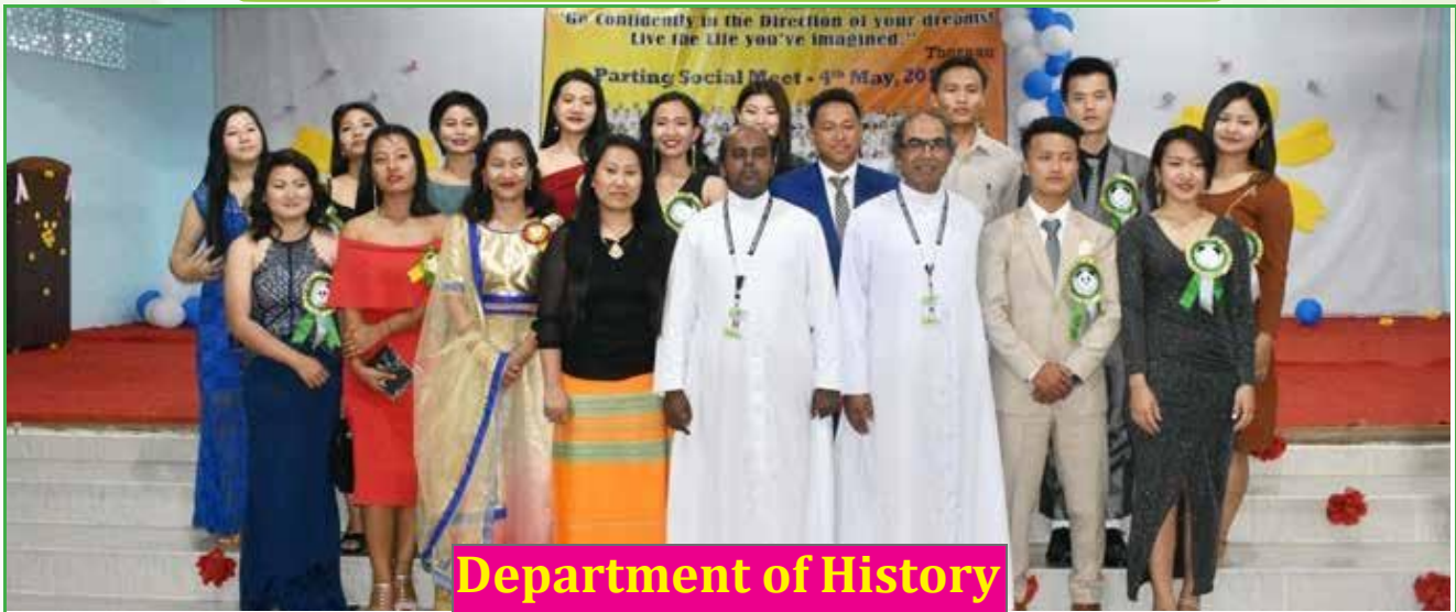
Department of History