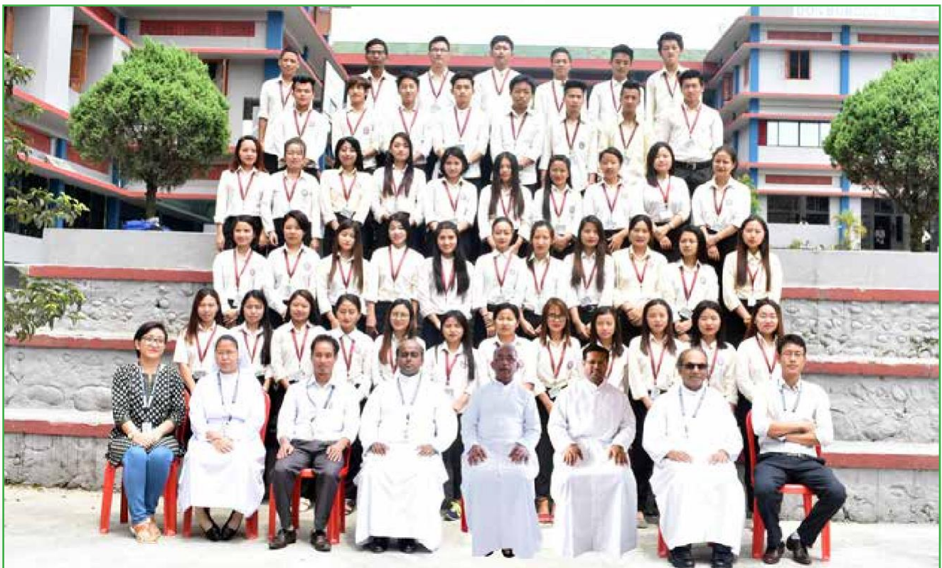
B.A. VI semester - Dept. of Sociology