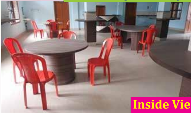
Inside View of Canteen