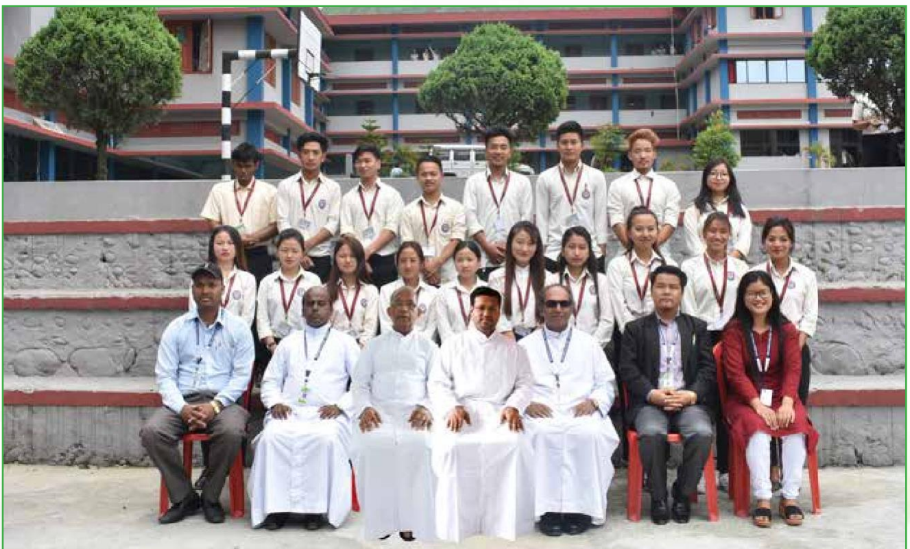
B.A. VI semester - Dept. of Economics