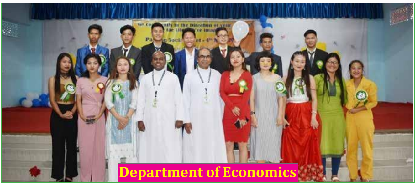
Department of Economics