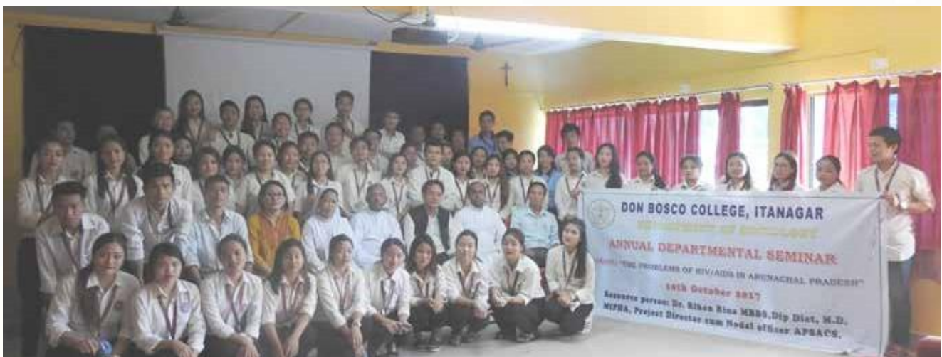
Department of Sociology