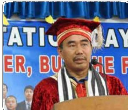
Shri Honchun Ngandam Minister, Education