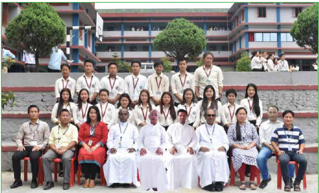
B.A. VI semester - Dept. of History