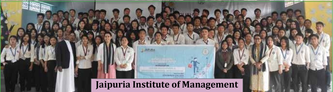
Jaipuria Institute of Management