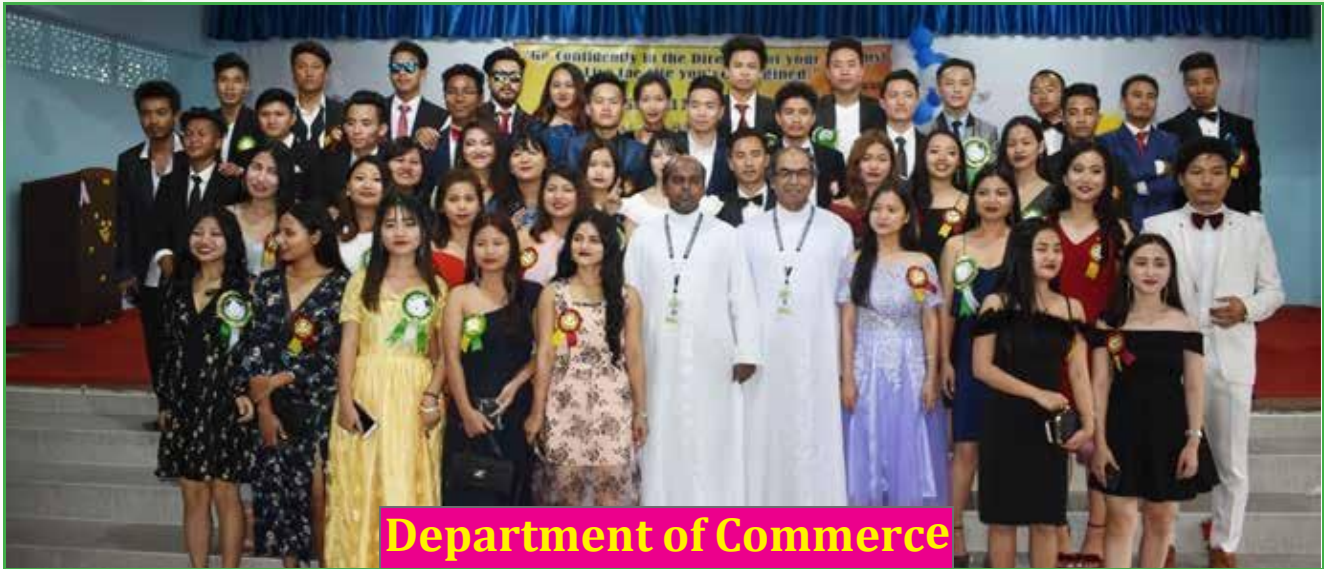
Department of Commerce