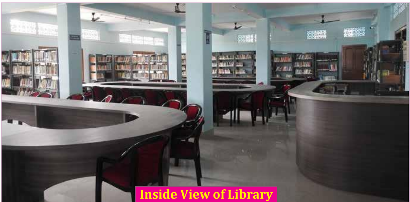
Inside View of Library