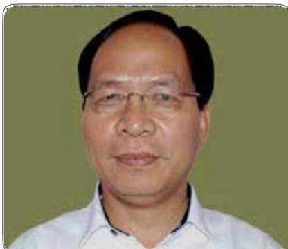
Shri Kamlung Mossang Minister, Civil Supplies & Mining