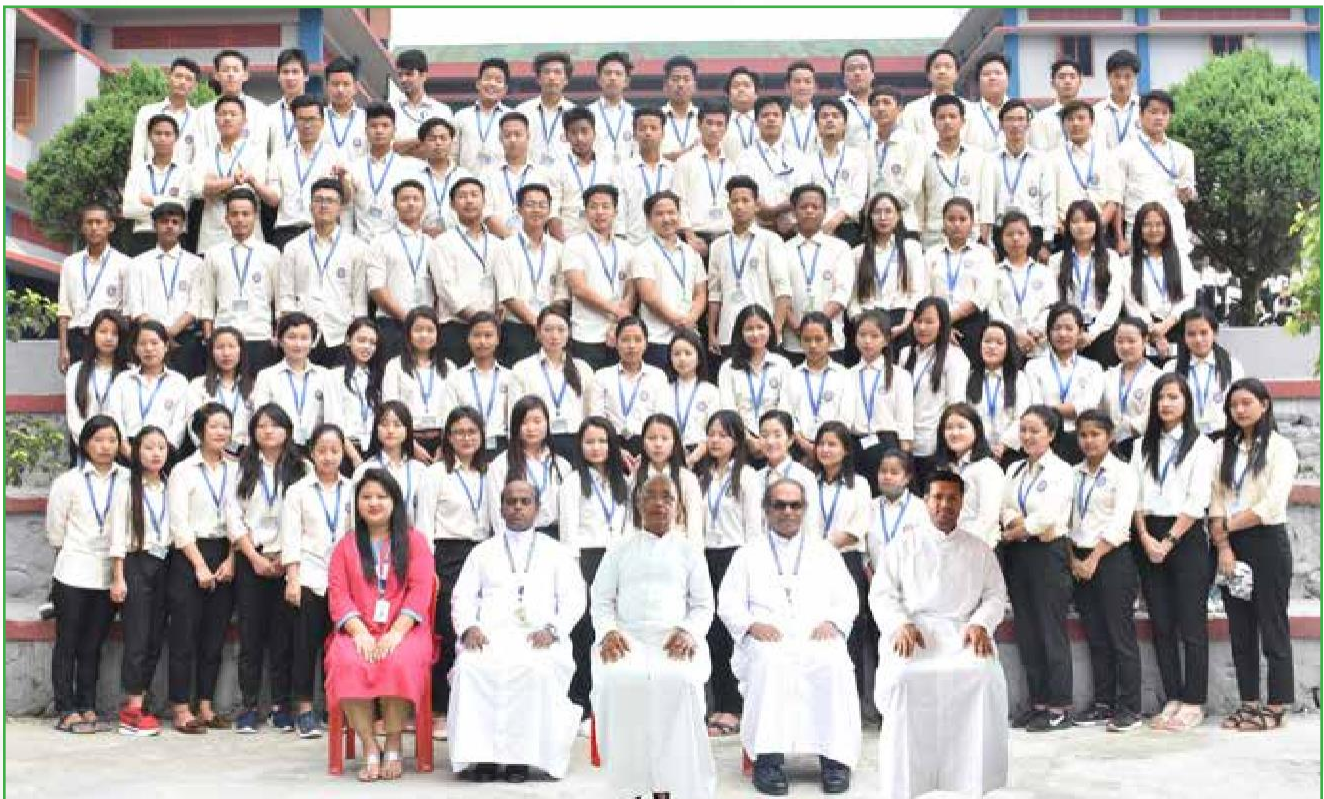
B.A. II semester, Sec-B