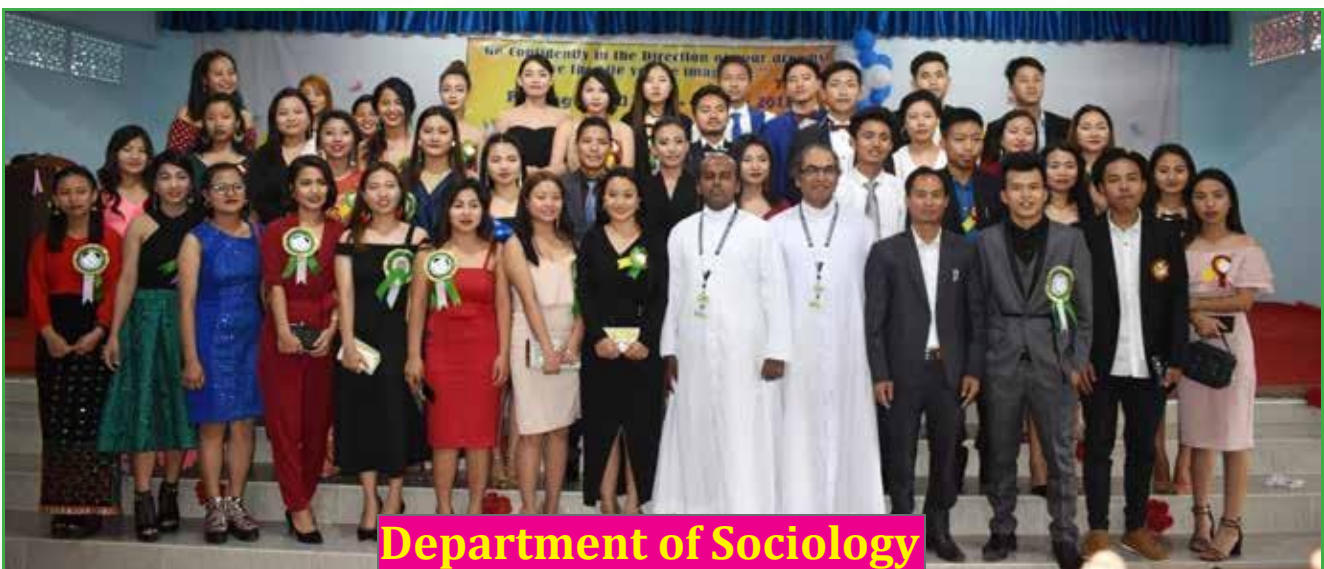
Department of Sociology