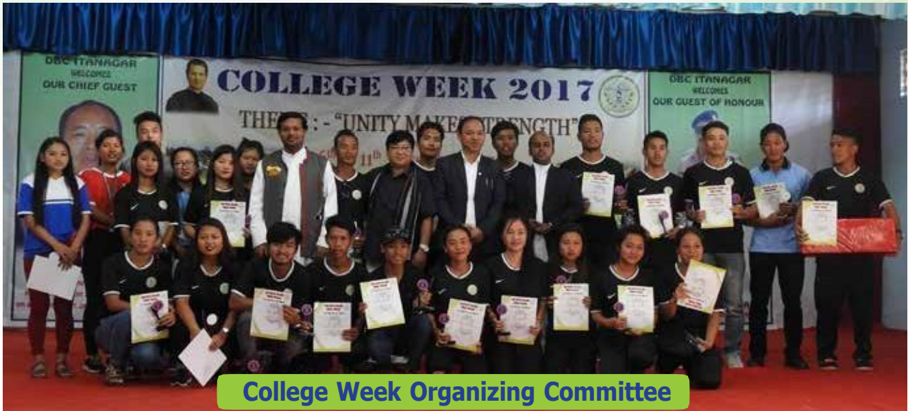
College Week Organizing Committee