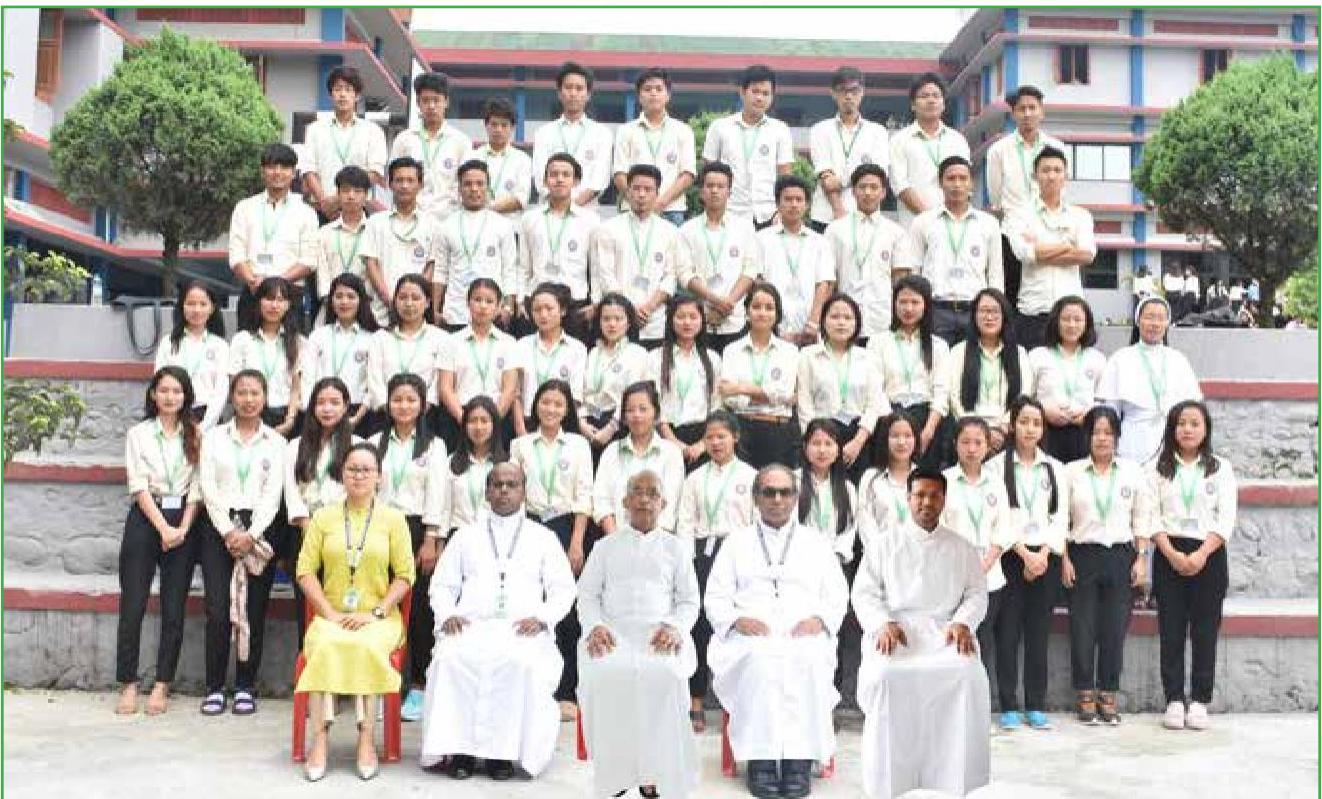
B.A. IV semester, Sec-A