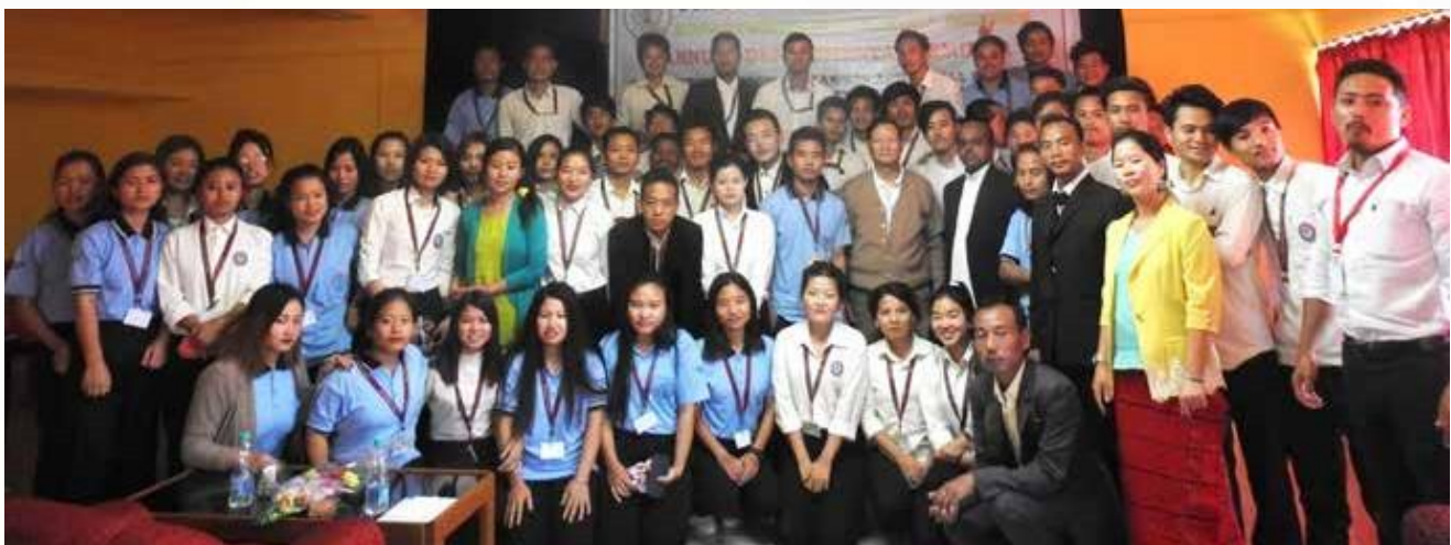
Department of Political Science