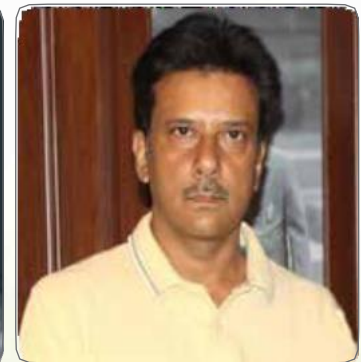
Shri Tappas Dutta Commissioner Tax & Excise, Govt. of Arunachal Pradesh