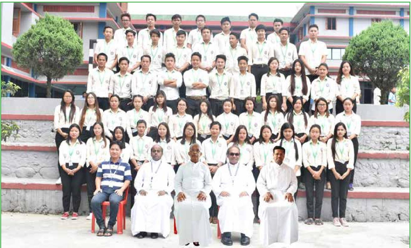
B.A. IV semester, Sec-C