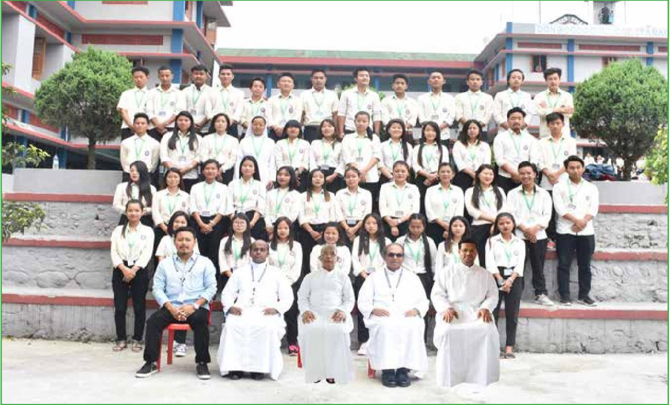
B.A. IV semester, Sec-B