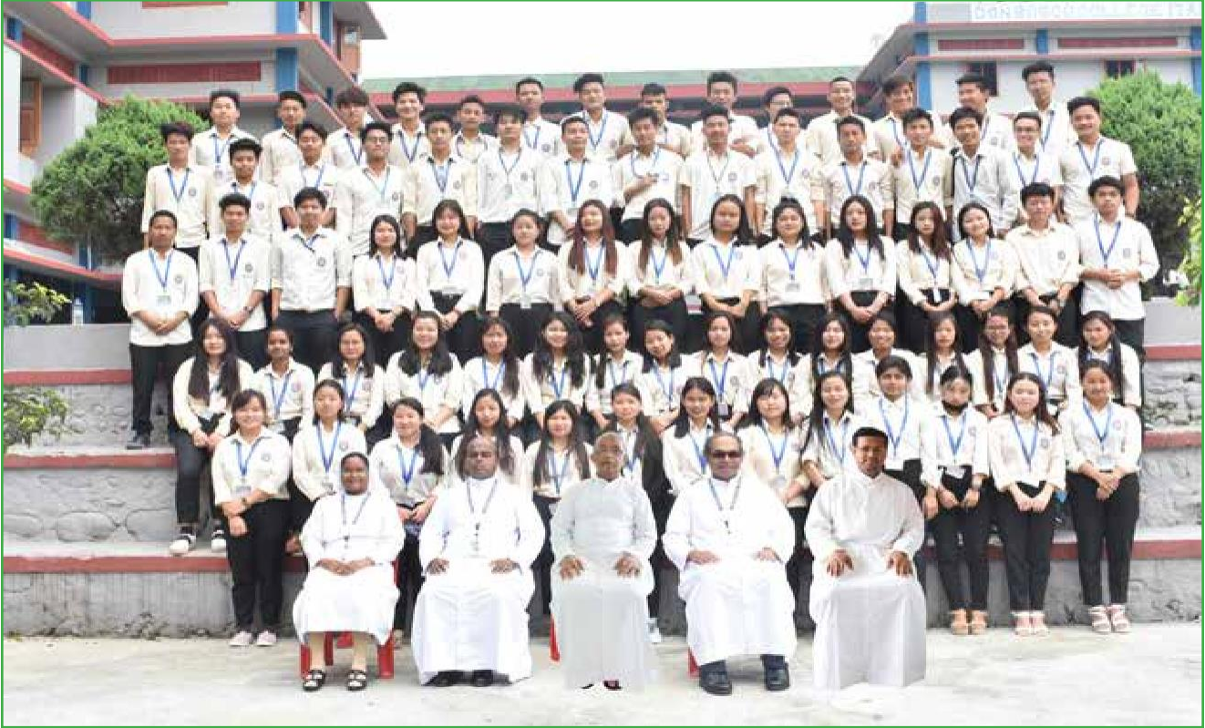
B.A. II semester, Sec-C