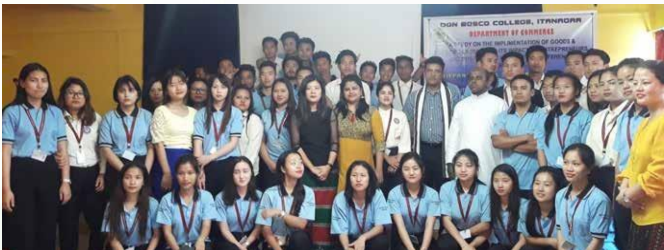
Department of Commerce