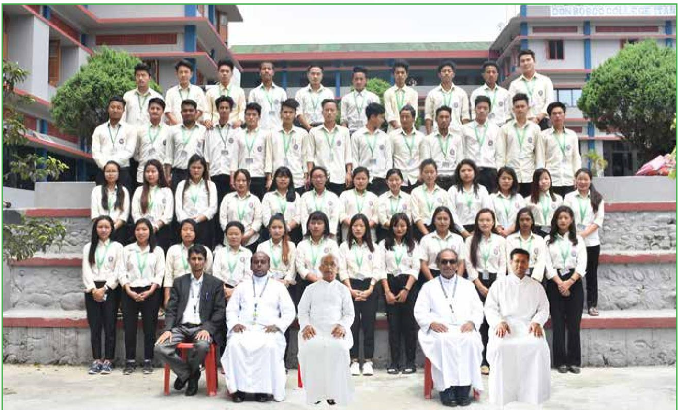
B.Com IV semester