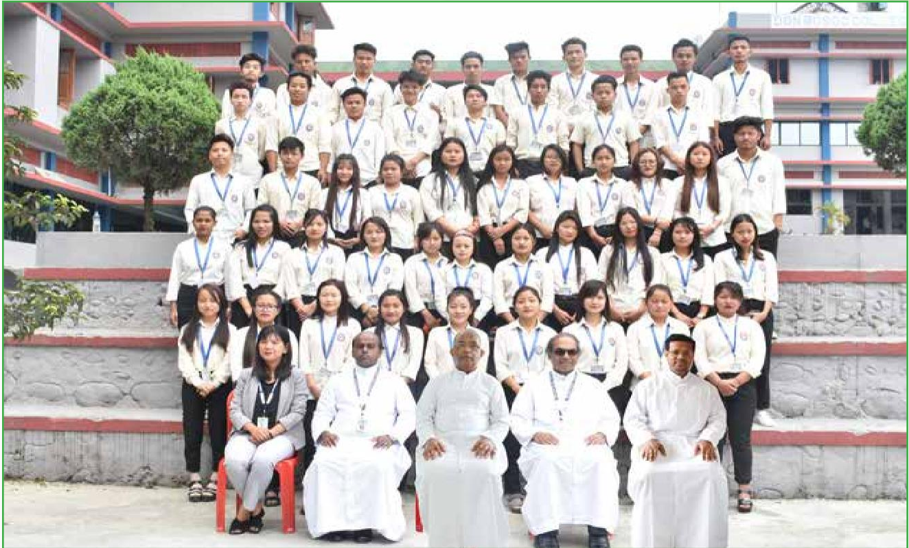
B.Com II semester