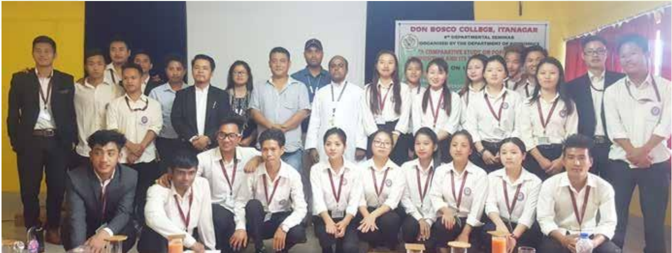
Department of Economics