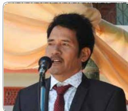
Shri Tai Kaye Deputy Commissioner cum District Magistrate, Papum Pare District, AP