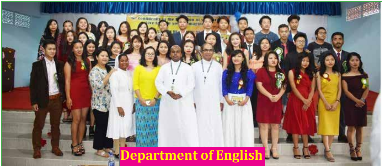
Department of English