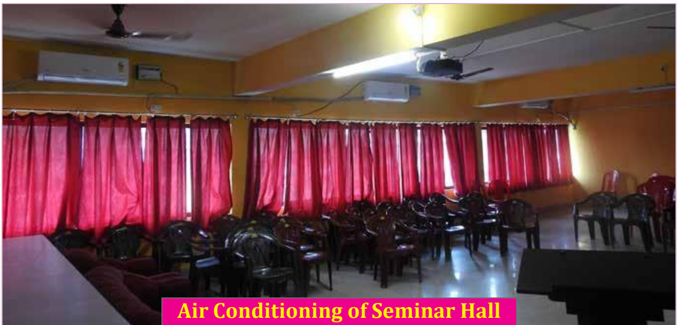
Air Conditioning of Seminar Hall