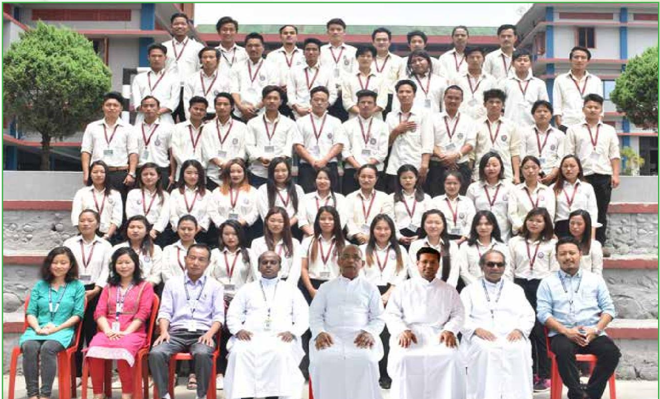
B.A. VI semester - Dept. of Political Science